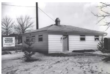
Early Portage Police Department